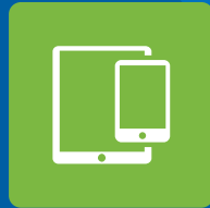
iVend Mobile POS