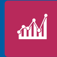
iVend Reporting & Analytics